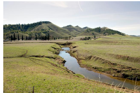
Land west of Maxwell in Colusa County is the proposed location of Sites reservoir, a plan announced in March by Reps. John Garamendi, D-Walnut Grove, and Doug LaMalfa, R-Richvale. The bipartisan move comes as some ask whether there is enough water left in the state to justify project costs.

Supporters of the Temperance Flat reservoir on the San Joaquin River make similar arguments. Among the five dam proposals, Temperance Flats would be the worst performer in terms of water supply, promising less than 6 percent of its capacity in water deliveries in an average year, and even less in dry years – about 2.3 percent, according to initial studies. But this is partly because much of its capacity would be reserved to provide water to restore salmon runs on the troubled San Joaquin River.