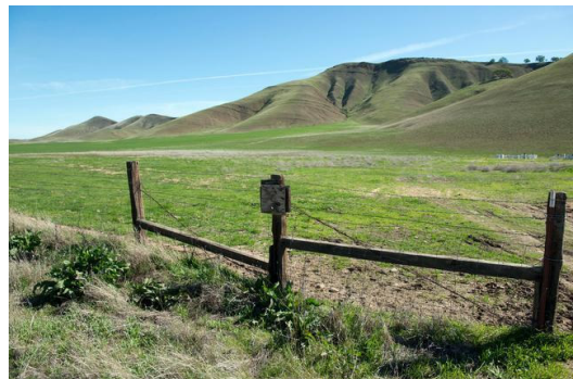
The proposed $3.8 billion Sites Reservoir in Colusa County would be filled by pumping water from the Sacramento River. Its capacity would be 1.8 million acre-feet.

But Sites supporters point to other benefits: One of its stated purposes is to relieve some of the water delivery burden from Shasta Lake so it can retain its deep pool of cold water to help salmon runs. Much of the economic justification in draft studies for the project's nearly $4 billion cost comes from this salmon benefit, not from water supply.