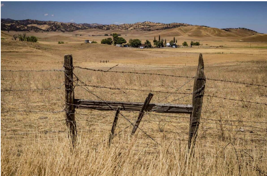
A farm sits near the location of land once owned by John Sites, the namesake of the community where Sites Reservoir is proposed. The area would be submerged under the reservoir plan.

Opponents of the proposed reservoir, in general, prefer alternative means of acquiring and storing water in California, such as building desalination plants, recharging aquifers and doing more water recycling — areas that Newsom's administration is also supporting, as reflected in a state water plan released in August .