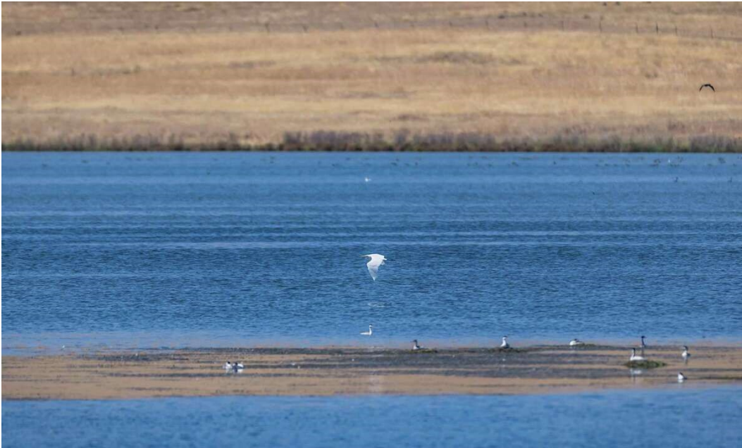
Waterfowl are visible in Funks Reservoir outside the town of Maxwell (Colusa County) on Aug. 9. The small reservoir would be used to help convey water from the Sacramento River to the proposed Sites Reservoir.

Local water agencies, including the Glenn-Colusa Irrigation District, are investors in the project and stand to have more water to provide area growers.