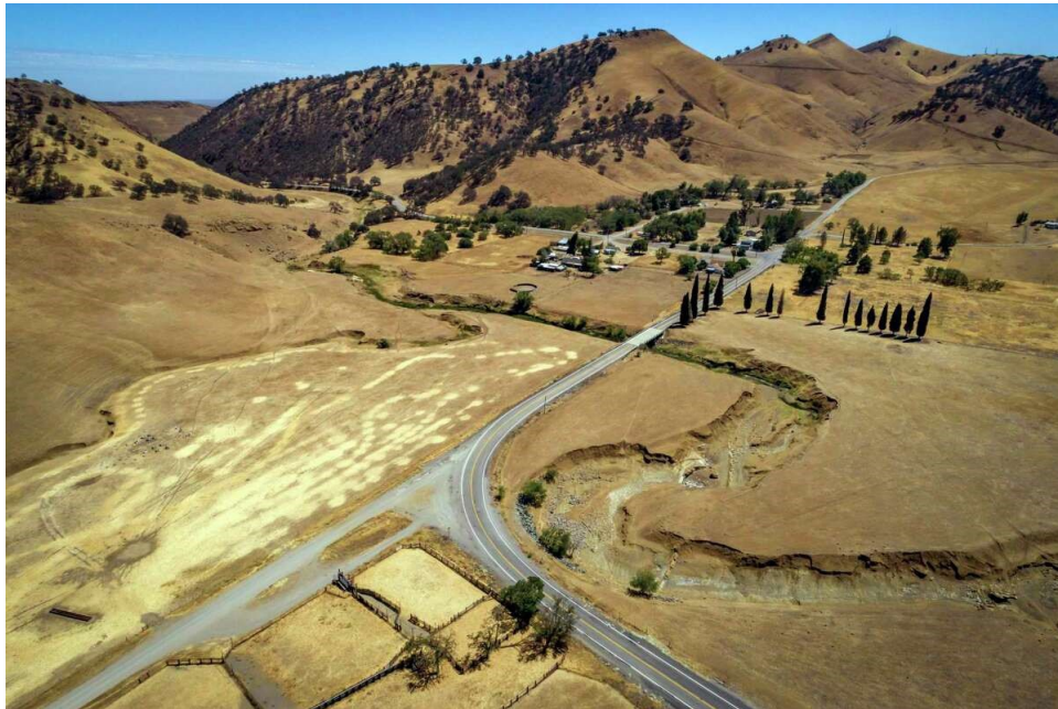
The rural community of Sites in Colusa County is shown in an aerial photograph on Aug. 9. An independent water authority is working to build a larger reservoir here and deliver supplies across California.