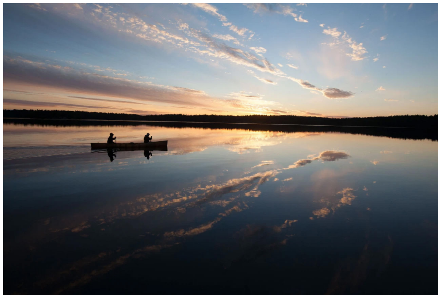
The Boundary Waters Canoe Area Wilderness.

Most of the ten rivers on the list face risks that were either created or exacerbated by the Trump Administration, which weakened environmental regulations, hobbled the EPA, made it easier for oil companies to drill in National Parks, and generally pursued policies that encouraged natural resource extraction at the expense of environmental considerations. For example, the Twin Metals copper mine poised to operate in Boundary Waters was greenlit in 2019. The contested mine has prompted a state legal review of mining regulations, and environmental advocates have squared off against the mining industry in protest of anticipated environmental damage. A coalition of environmental groups filed a lawsuit against regulators in 2020 alleging that the environmental review of the proposed mines didn’t comply with legal requirements. The lawsuit was paused in 2021 pending a review of the decision to grant the mining permits by the Biden Administration.