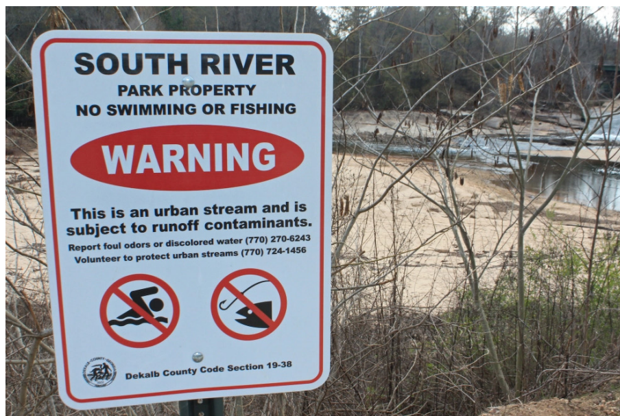
A warning sign on the South River near DeKalb, Georgia.