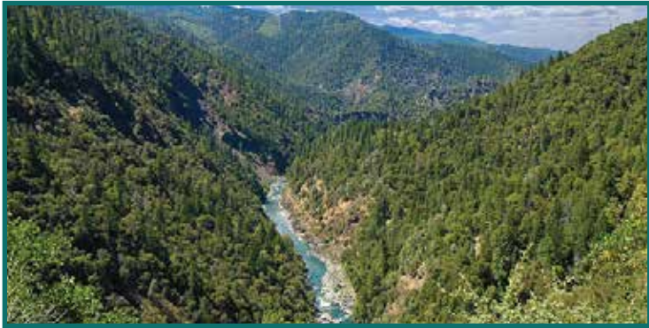
South Fork Trinity River

Dams were also on our mind. We helped lead a coalition of groups to beat back (for now) an attempt by the Westlands Water District to partner with the U.S. Bureau of Reclamation's attempt to expand Shasta Reservoir into a portion of the McCloud River protected by the California Wild & Scenic Rivers Act.