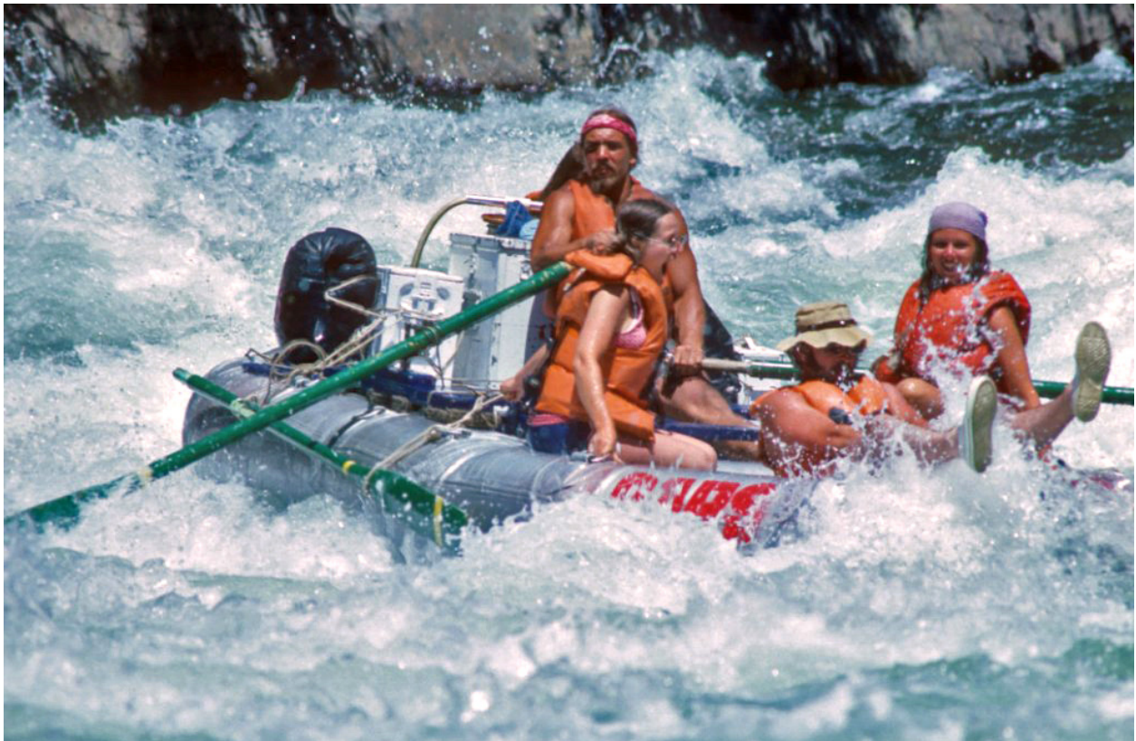
Rafters revel on an OARS raft loaded for an overnight trip at the bottom of Bailey Falls in high water on the Stanislaus River in 1974.

together by the federal Bureau of Land Management and U.S. Department of the Interior to tout recreation on the Stanislaus River.