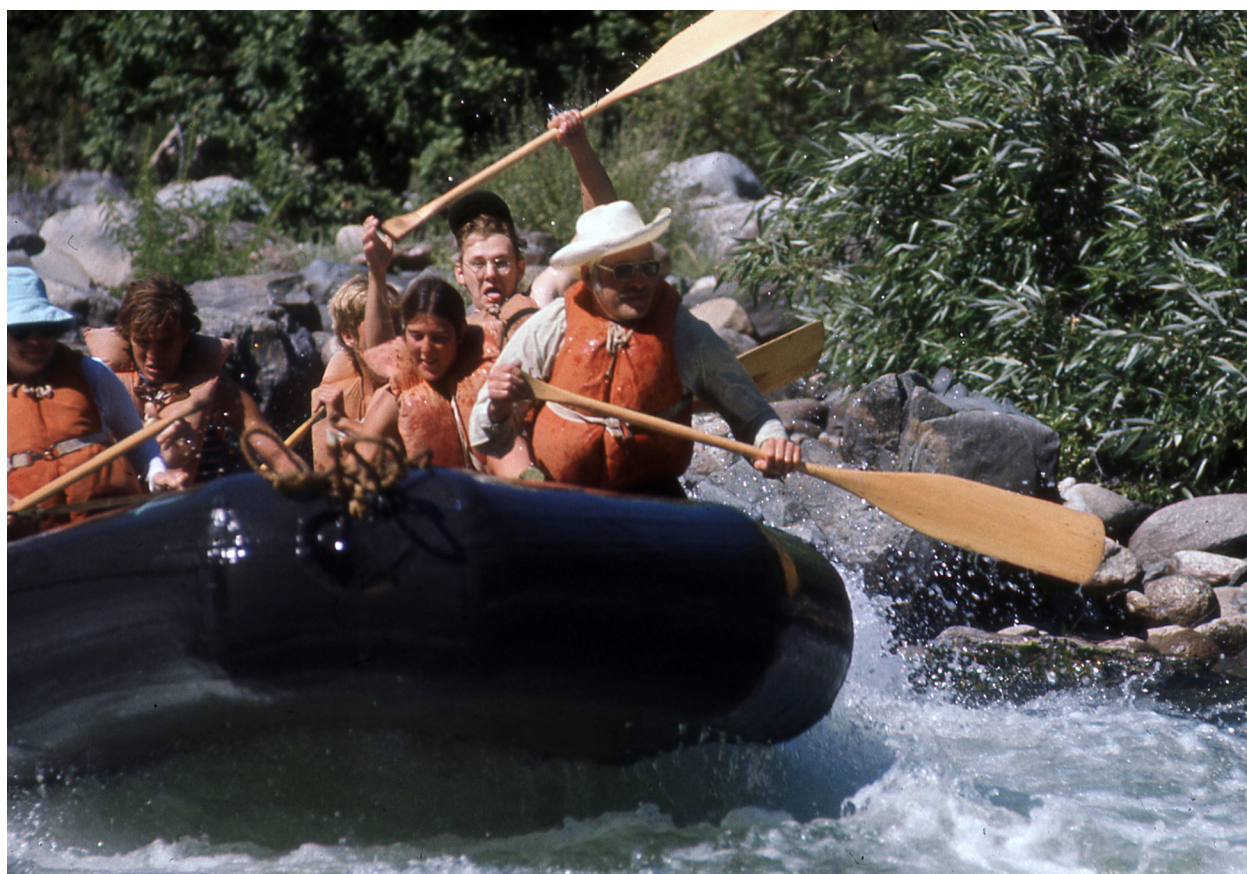
Rafters run a rapid with wood paddles on the Stanislaus River in 1972.

They lost a battle so devastating some still refuse to look at New Melones Reservoir.