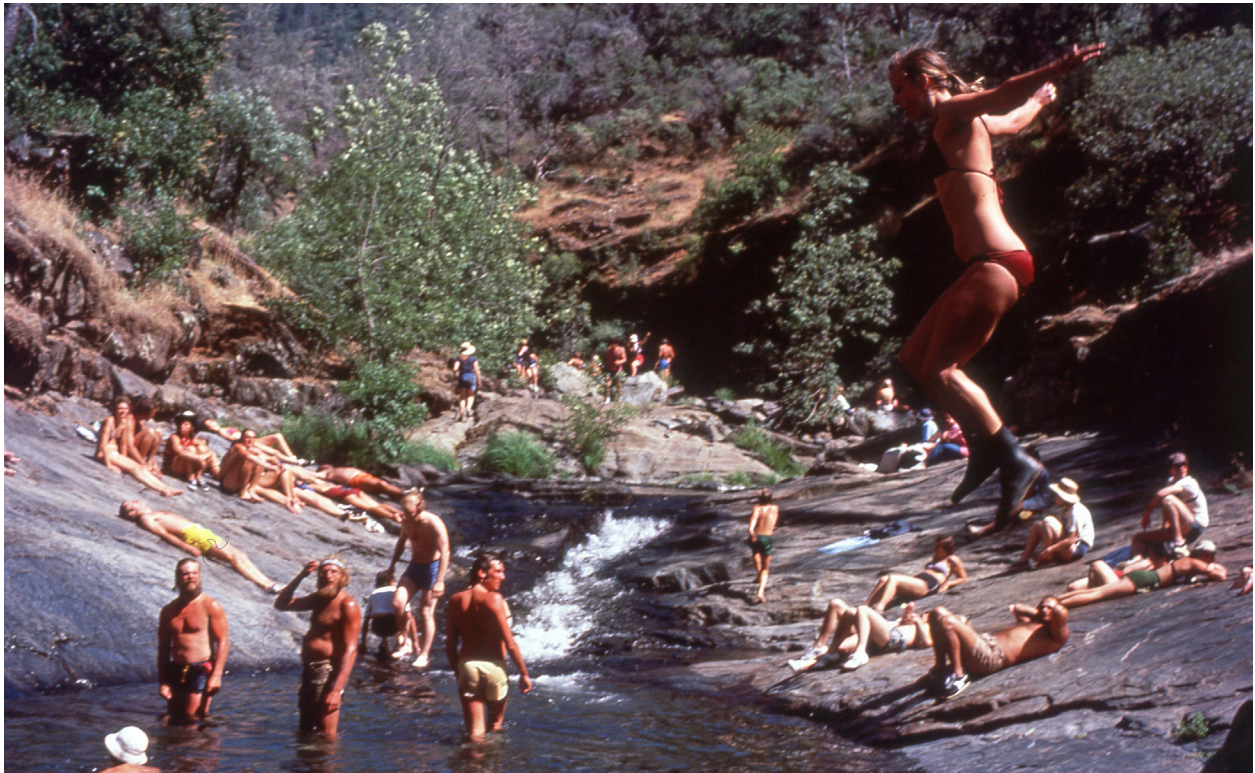
Rafters enjoy the jumping pool on Rose Creek, a tributary to the Stanislaus River on the Tuolumne County side, in August 1976.

“I see the photos of Gov. Brown and Prop 17,” he said. “What do Brown and Prop 17 have to do with it?”