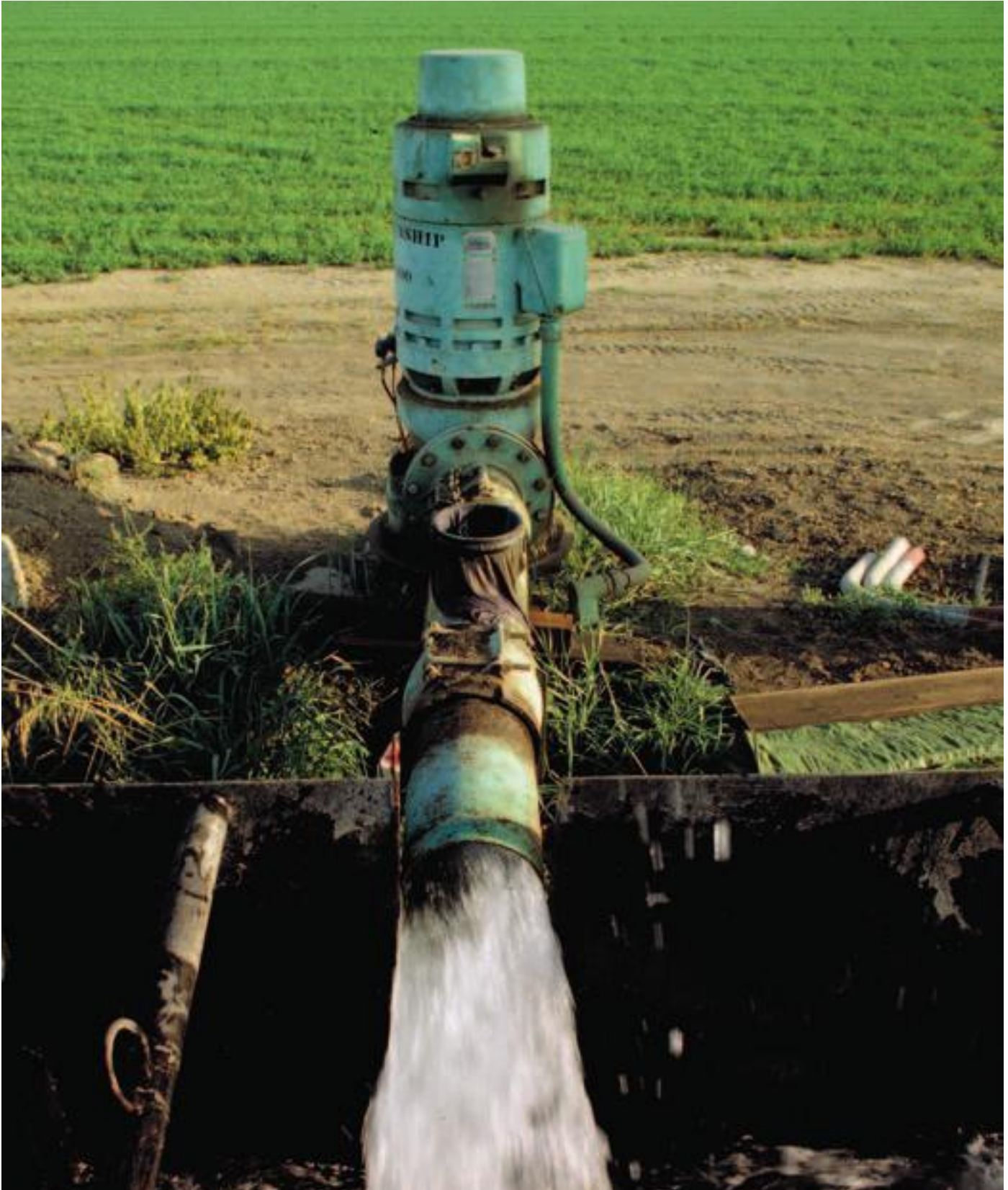
Conjunctive management allows surface water and groundwater to be managed in an efficient manner by taking advantage of the ability of surface storage to capture and temporarily store storm water and the ability of aquifers to serve as long-term storage.